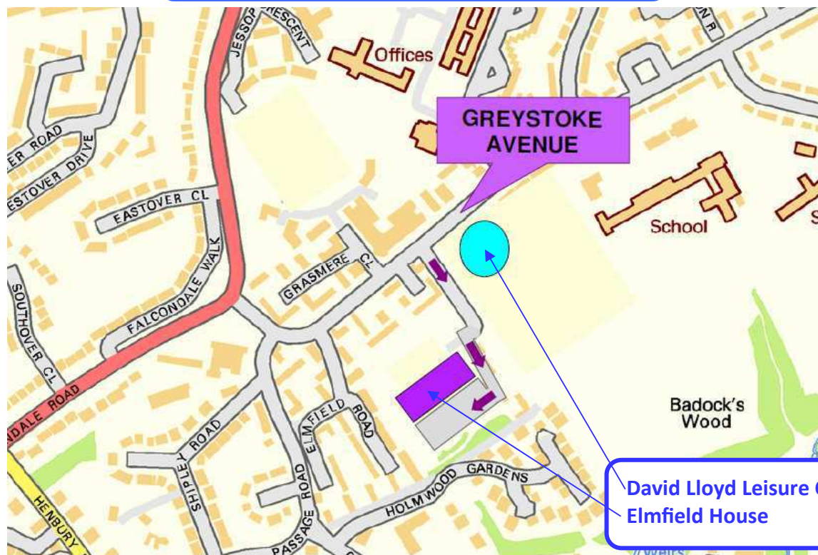
David Lloyd Leisure Centre Elmfield House

It is the role of the Sensory Support Service to minimise the disabling impact of sensory impairment and to ensure positive outcomes for Children and Young People with sensory impairment.